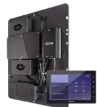
Integrator Kit C-Series

For more information on Microsoft Teams and Crestron Flex visit crestron.com/teams