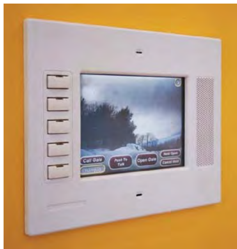
A Crestron touchpanel shows the gate control screen with video from one of the home's outdoor cameras.

Expo pulled the system out even before they invoiced it. "We felt it wasn't going to work the way