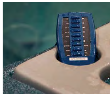
One of Home Entertainment Expo's first projects for his Westwood, MA, client was to rework a distributed audio system installed by another contractor, adding Crestron control panels in various rooms and waterproof remotes for the pool and an indoor spa.

"At that point, it's no longer a conversation